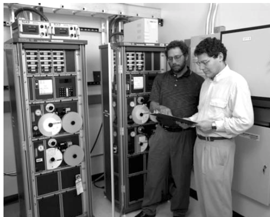
A safe tomorrow: NCPV staff, shown inspecting a gas monitoring system, are helping to resolve ES&H issues of advanced PV technologies.